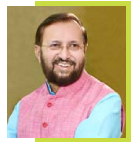
SHRI PRAKASH JAVADEKAR Hon'ble Minister of Environment, Forest & Climate Change and Information & Broadcasting

NARENDRA MODI , Hon'ble Prime Minister of India